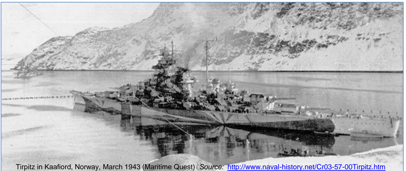
Tirpitz in Kaafjord, Norway, March 1943