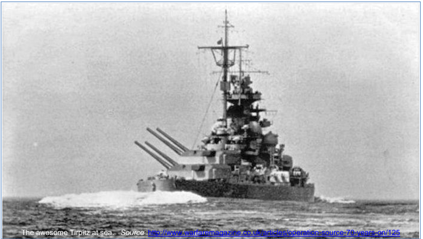
The awesome Tirpitz at sea.